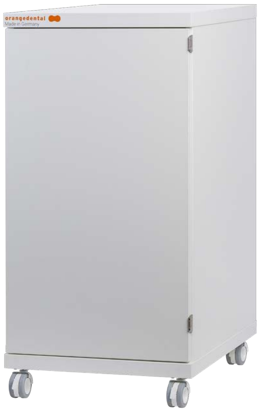
High-quality cabinet with lots of storage space.